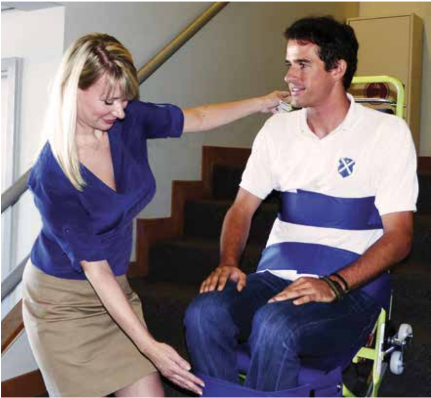
If stopping on the stairway during evacuation becomes necessary, the fully loaded Evacu-Trac will stay stationary and stable on the stairs without any support from the operator.