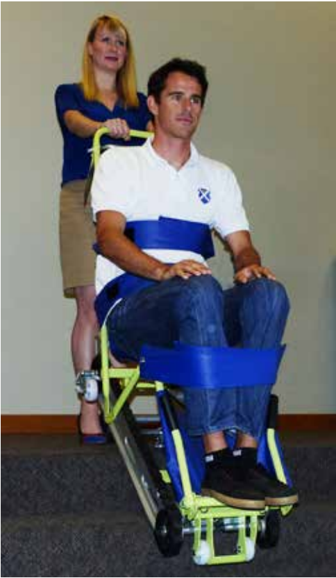
During descent the passenger sits in a comfortable, upright position, securely held by three safety straps.

During an emergency, the passenger is transferred from their wheelchair to the Evacu-Trac. Once positioned in the Evacu-Trac, velcro straps are wrapped securely around the passenger’s torso and lower legs.